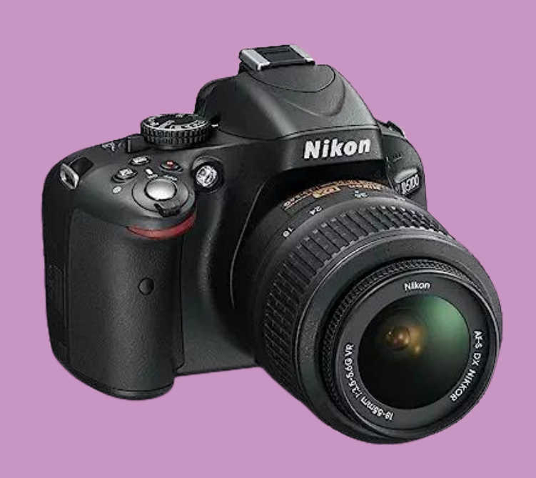
DSLR + memory card £300