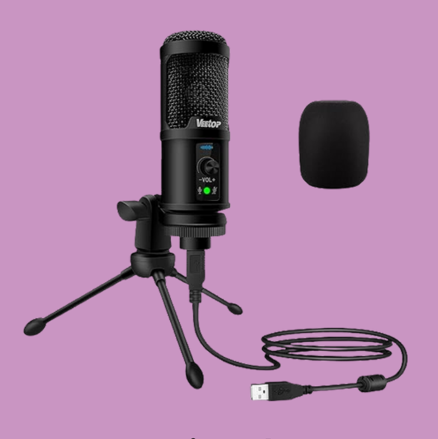
USB microphone £15