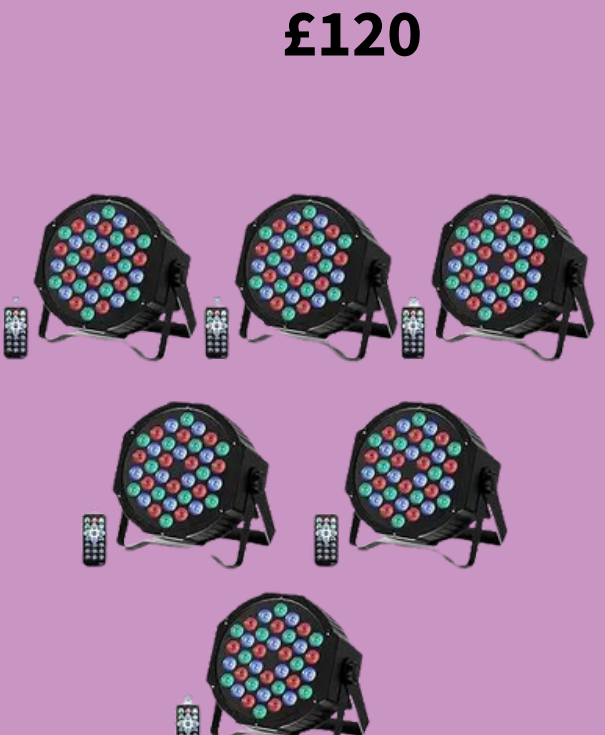
Multi-coloured stage lights £120