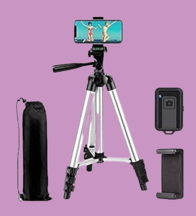
Phone/camera tripod £15