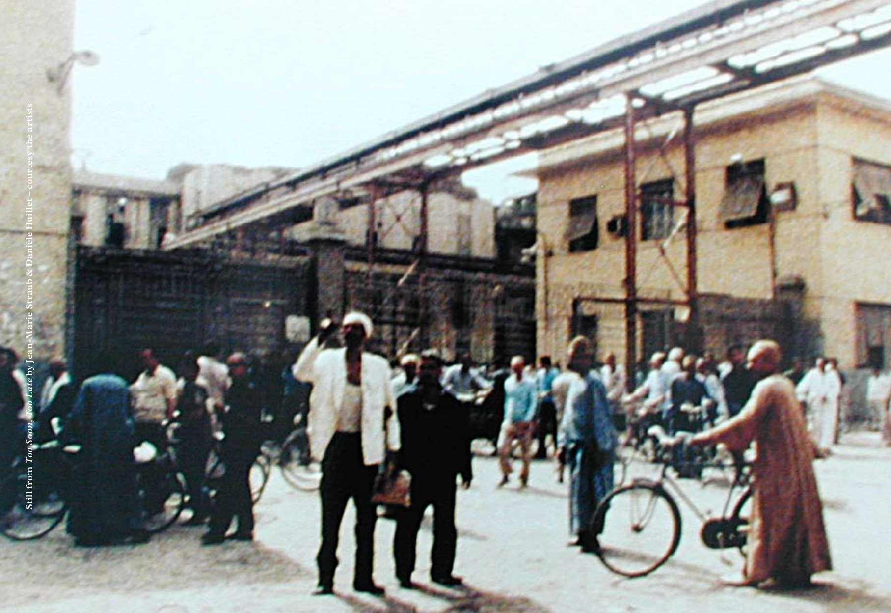
Still from Too Soon, Too Late by Jean-Marie Straub & Danièle Huillet