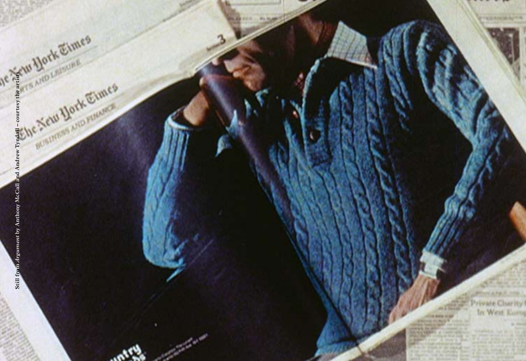
Still from Argument by Anthony McCall and Andrew Tyndall