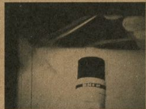
Rubber Band - David Askevold

A variety of pastoral scenes are rudely interrupted. Documenting sound and its effect.