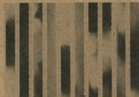
Available Light: Yellow - Red - Luis Recoder

"A series of tail ends of varied strips of film, with sometimes recognisable images dissolving into light flares, appear to run through and off the projector. A romantic 'narrative', suggesting an 'ending', is inferred." www.atopia.no