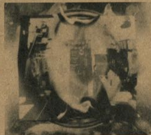
(nostalgia) - Hollis Frampton