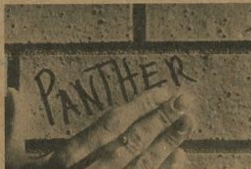
Zorns Lemma - Hollis Frampton

Or put another way: the film's a sound-image riddle that approximates the mental tasks of: childhood (learning to hear before being able to see); young adulthood/maturity (learning to perform complex tasks, to attribute meaning to what we see in context) and; old age (a walk into a forest as a metaphor for the acceptance of death).