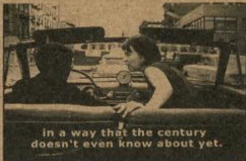
The Last Clean Shirt - Alfred Leslie

It is a blueprint for The Last Clean Shirt in which a man and a woman take a car ride through the streets of downtown Manhattan. A clock on the dashboard foregrounds the fact that the film is a single shot. The woman speaks in Finnish jibberish, interpreted by the beautiful and brilliant story told via O'Hara's subtitles that run throughout.