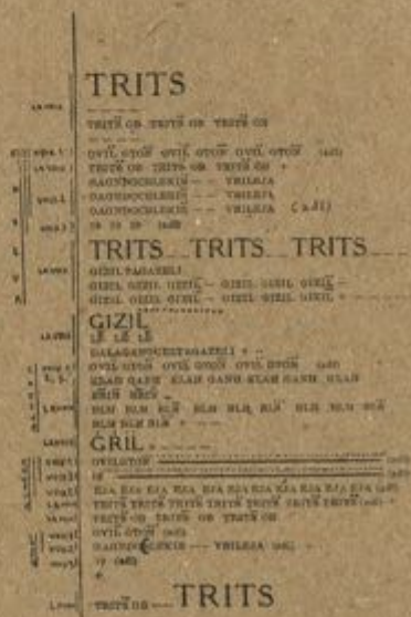
L'Anticoncept - Gil Wolman

Wolman was a truly radical 15 figure in post-war France, who extended a personal exploration into creative expression that went way beyond established commercial, or even avant-garde forms of the time. L'Anticoncept refutes narrative, image, traditional projection and the status quo in 60 minutes of angry exhalation, and re-imagines film as a political, abstract artform created not from some poetic muse or attempt at representation, but built up of distinct units and intervals: the human breath, the filmic pulse, difference and repetition.