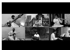
Official video – screenshot