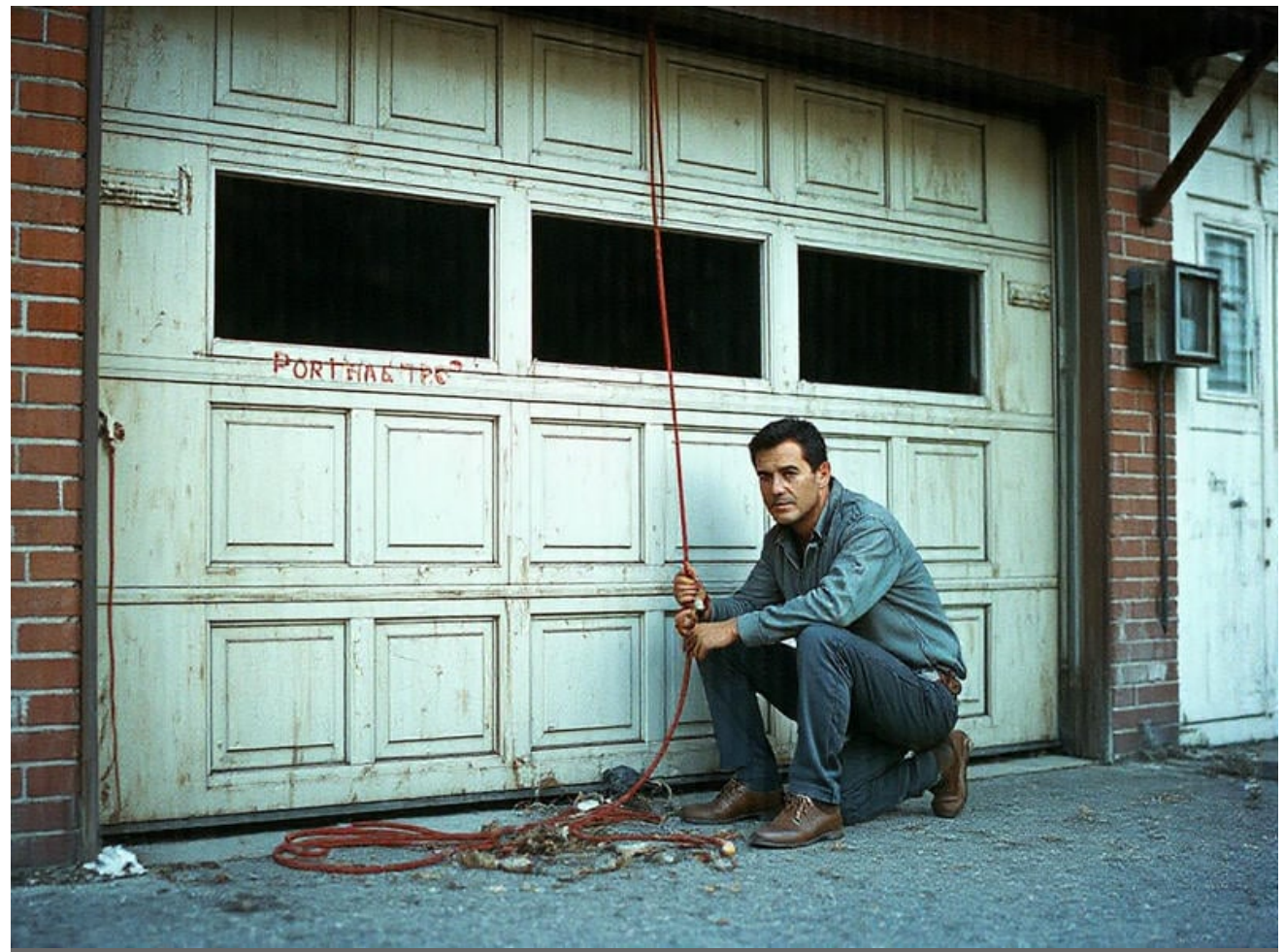
offering homeowners a seamless blend of cutting-edge technology and everyday practicality.

Firstly, one of the most compelling advantages is the sheer convenience it provides. With voice-controlled garage doors, homeowners can operate their doors without having to fumble for remotes or smartphones. Imagine arriving home with your hands full of groceries; instead of putting everything down to find the remote, you simply instruct your virtual assistant to open the garage door.