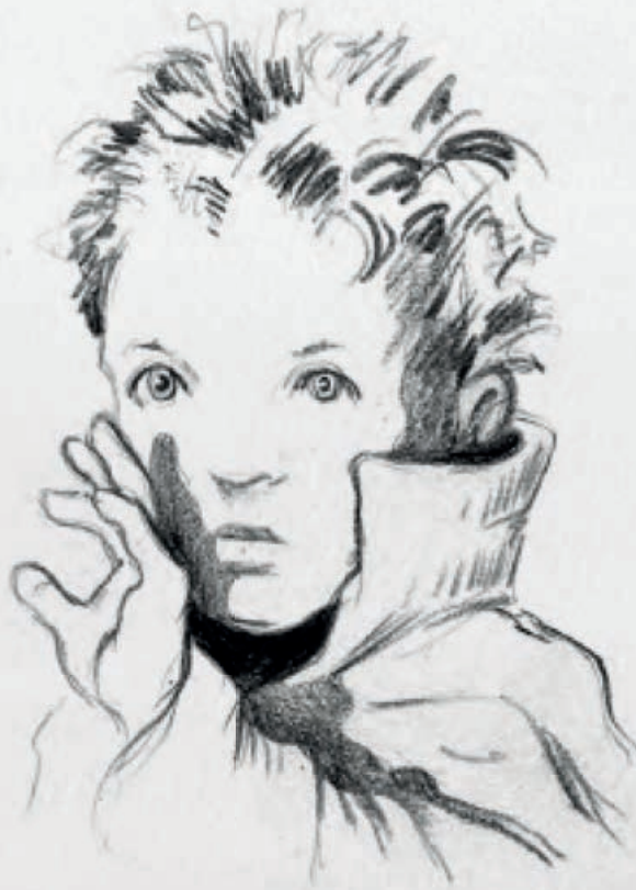
Preliminary sketches by Michel Hazanavicius

It's the story. The story imagined by Jean-Claude Grumberg is what swept away all of my convictions in that respect. It's a deep, powerful, humanist story, and at the same time it's subtle and modest and when I discovered it, before it was even published, for me, it was a classic. What was undoubtedly the most difficult for me, as a film director, was finding a story that was worth the trip. You can always find good scenes, good actors, good situations, and good movie moments, but when you find a really great story you can't pass it up. That's basically what happened. I accepted