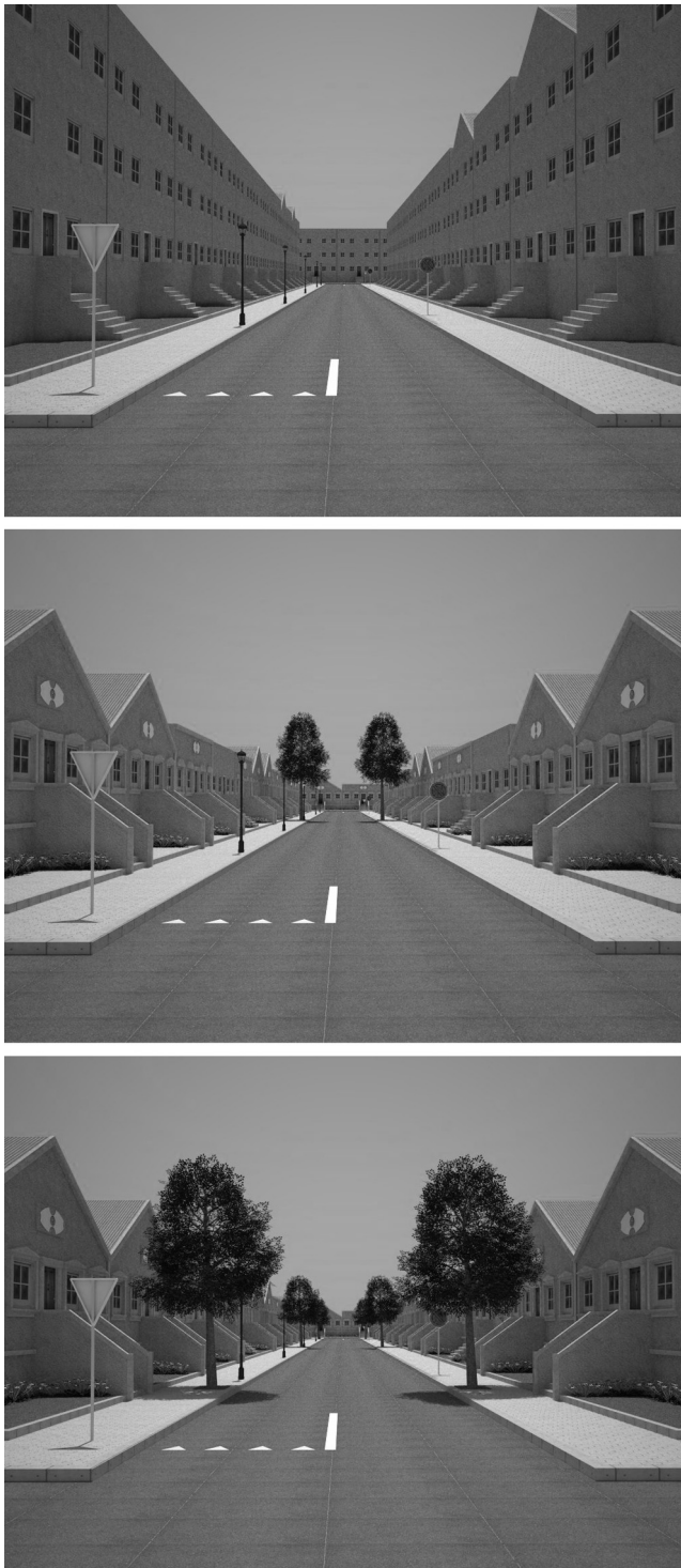
Fig. 1. Streetscape images with the highest, lowest and closest to average likelihood of restoration ratings, calculated looking across the participants who provided the ratings. (From left to right) The streetscape image with lowest mean rating for restoration likelihood ( M = 2.43 , SD = 2.19 ), the streetscape image with the closest-to-average mean rating for restoration likelihood ( M = 4.24 , SD = 1.74 ) and the streetscape image with highest mean rating for restoration likelihood ( M = 6.74 , SD = 2.51 ).