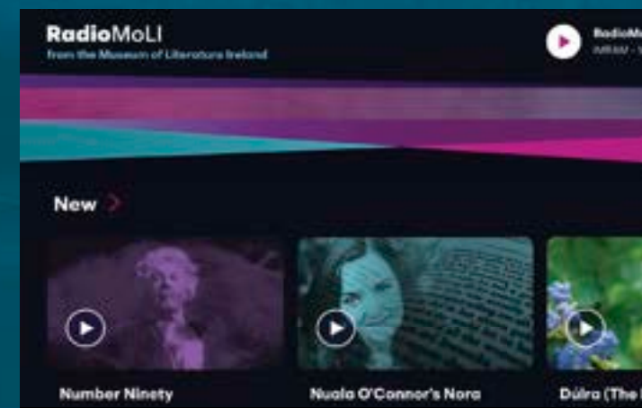
RadioMoLI Ireland's Literature Channel