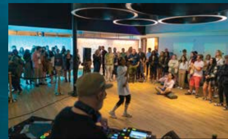
First Fridays at MoLI