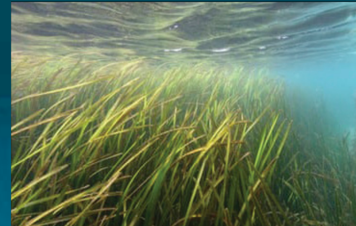
Literature & Climate Change