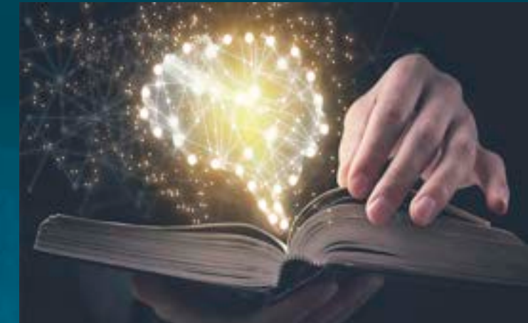
AI & Writing