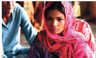
THY WOMB BRILLANTE MENDOZA