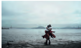
ESSE AMOR QUE NOS CONSUME ALLAN RIBEIRO