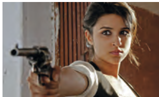
BORN TO HATE... DESTINED TO LOVE