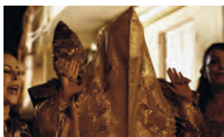
DIE WELT ALEX PITSTRA