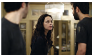
LE PASSÉ ASGHAR FARHADI