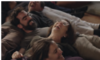
GLORIA SEBASTIÁN LELIO