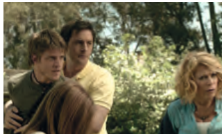
LA CULPA DEL CORDERO GABRIEL DRAK