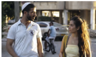
GOD'S NEIGHBORS MENI YAESH