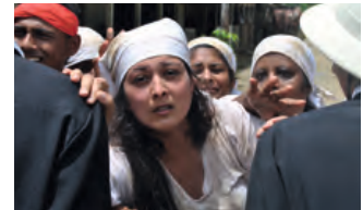
HET GEHEIM VAN MARIËNBURG