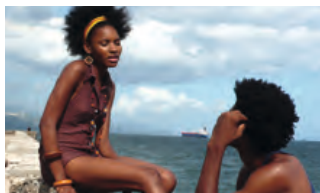
BETTER MUS' COME STORM SAULTER