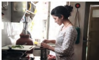
THE LUNCHBOX RITESH BATRA