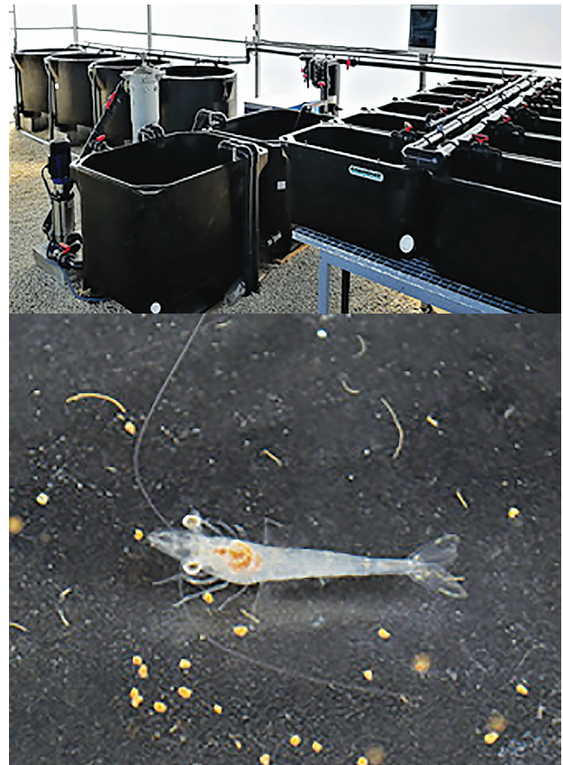
Figure 1. One of Riasearch Lda RAS systems where shrimp larval trials are performed (left) and Pacific white shrimp post-larvae feeding on inert microdiets in one of the trial tanks (right).

Most microdiet formulation tests have been done on post-larvae and early juvenile shrimp and a wide range of ingredients has been contemplated. The rapid expansion of shrimp farming has generated increases in the demand for commercial feeds for the on-growing phase of production, that represents the bulk of