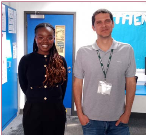
Computing careers workshop

Year 12 had more extensive presentations on degree apprenticeships, choosing university courses, the application process, personal statements and student finance. Hence, they were able to start the post 18 application process in May. In June, all year 12 attended the annual UCAS Discovery Fair held