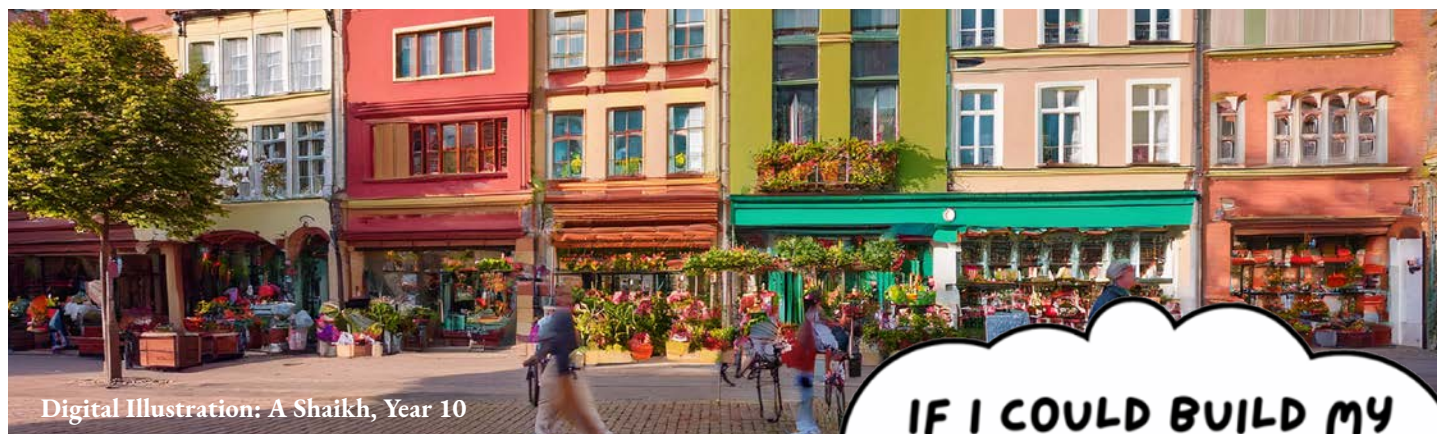
Digital Illustration: A Shaikh, Year 10