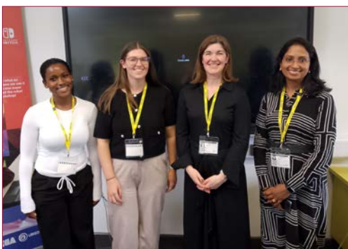
Finance careers workshop