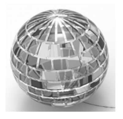
Floor lamp - DM/081858 WIN SRL

While the functional elements of a lamp will generally not differ significantly from product to product, its appearance is likely to be one of the major determinants of success in the marketplace. This is why industrial registers in many countries have a long list of designs for household products such as lamps.