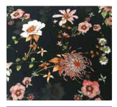
Fabric patterns – DM/094167 IPEKER TEKSTIL

In some countries, the applicable law recognizes the possibility of copyright protection for some designs, for example those incorporated in textiles and fabrics.