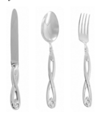
Set of cutlery – DM/080996 SAVIO FIRMINO DI SAVIO GUIDO E C. S.N.C