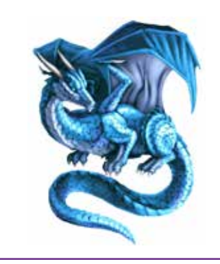
DM/086533 RP-TECHNIK GMBH

Traditionally, designs relate to features of manufactured products, such as the shape of a shoe, the design of an earring or the ornamentation on a teapot. In the digital world , however, design protection is gradually extending to new products and types of design. These include, for instance, electronic desktop icons generated by computer codes, typefaces, the graphic display on computer monitors and smartphones, and so on.