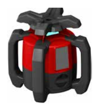
Rotation lasers – DM/082519 HILTI AKTIENGESELLSCHAFT

The Hilti rotation lasers used in the construction industry are protected not only by design rights but also by trademark and patent rights.