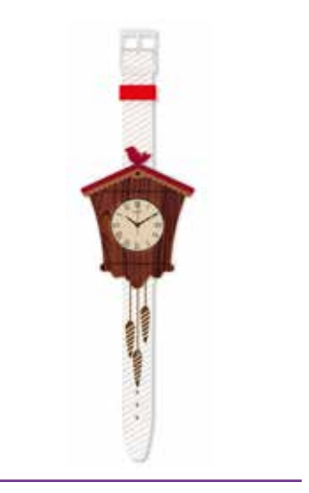
Wristwatch - DM/091792 SWATCH AG