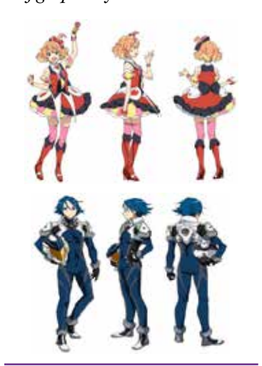
DM/097710 KABUSHIKI KAISHA BIGWEST