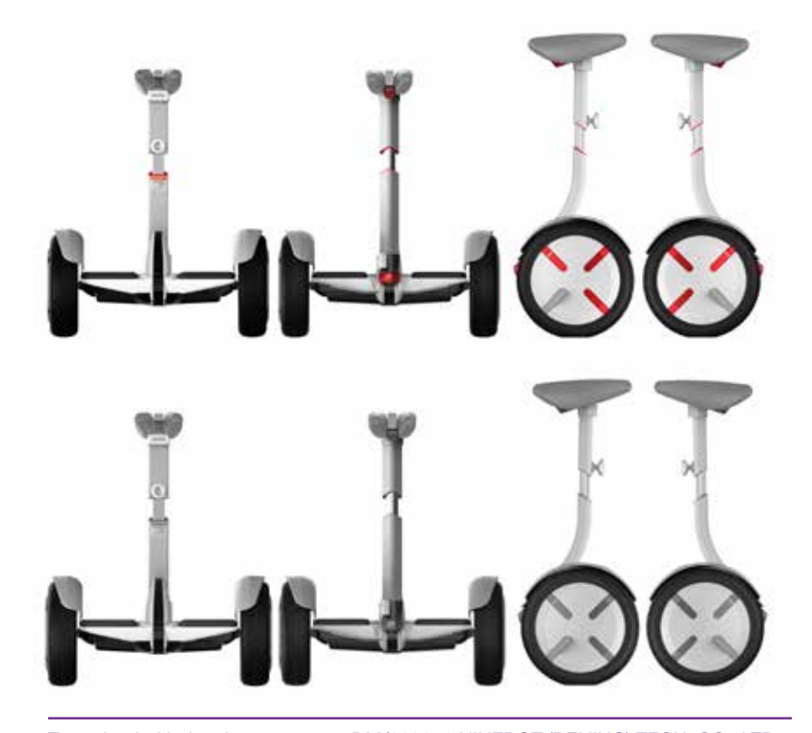
Two wheeled balancing scooters - DM/089858 NINEBOT (BEIJING) TECH. CO., LTD