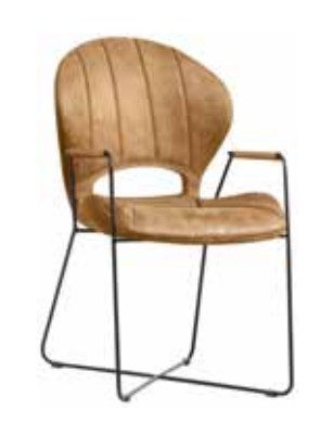
Armchair – DM/096353 FONKEL MEUBELMARKETING

In everyday language, an industrial design generally refers to a product's overall form and function. An armchair is said to have a "good design" when it is comfortable to sit in and we like the way it looks. For businesses, designing a product generally implies developing the product's functional and aesthetic features, taking into consideration issues such as the product's marketability, manufacturing costs and ease of transport, storage, repair and disposal.