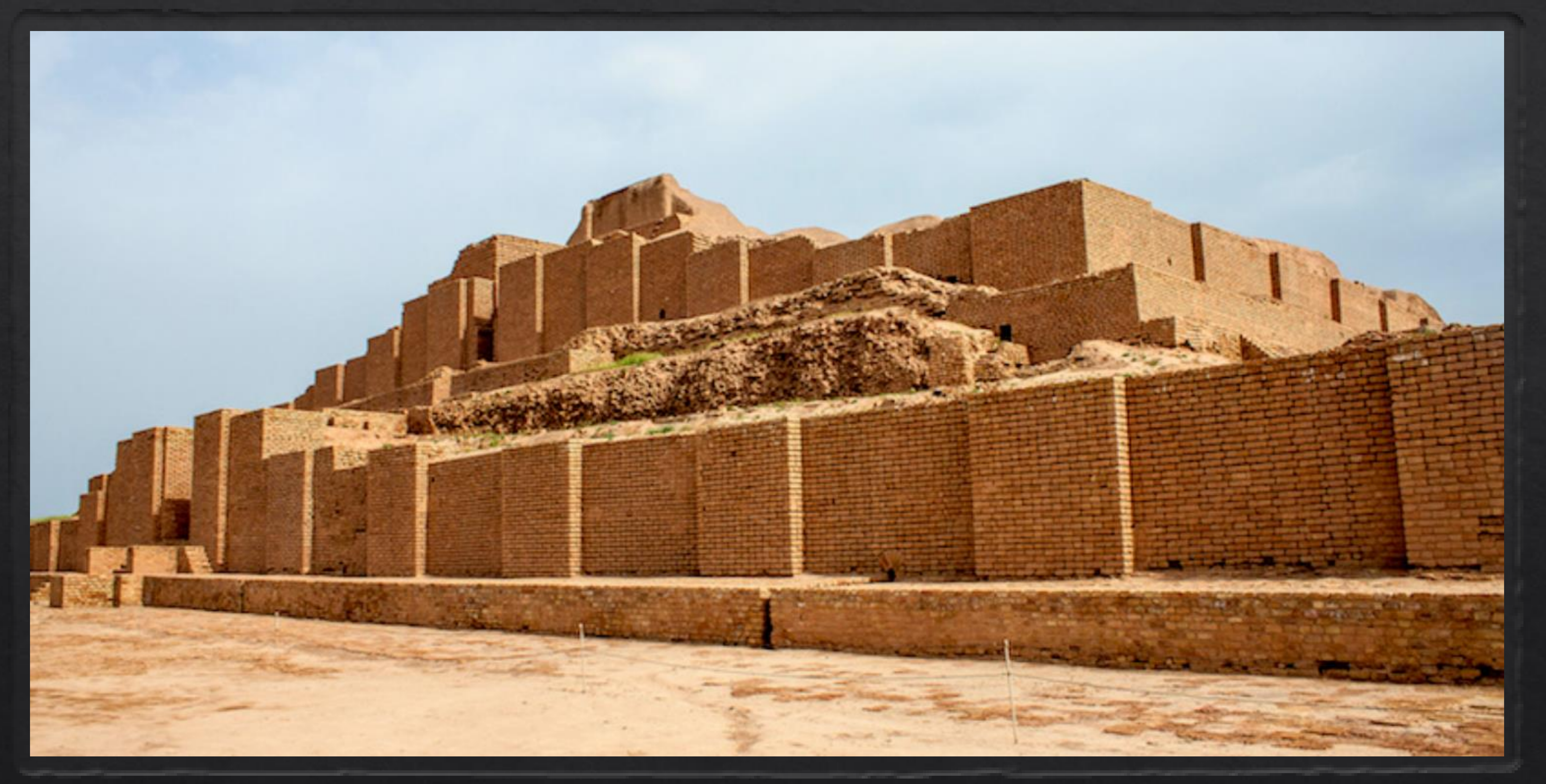
ELAMITE ZIGGURAT IN IRAN