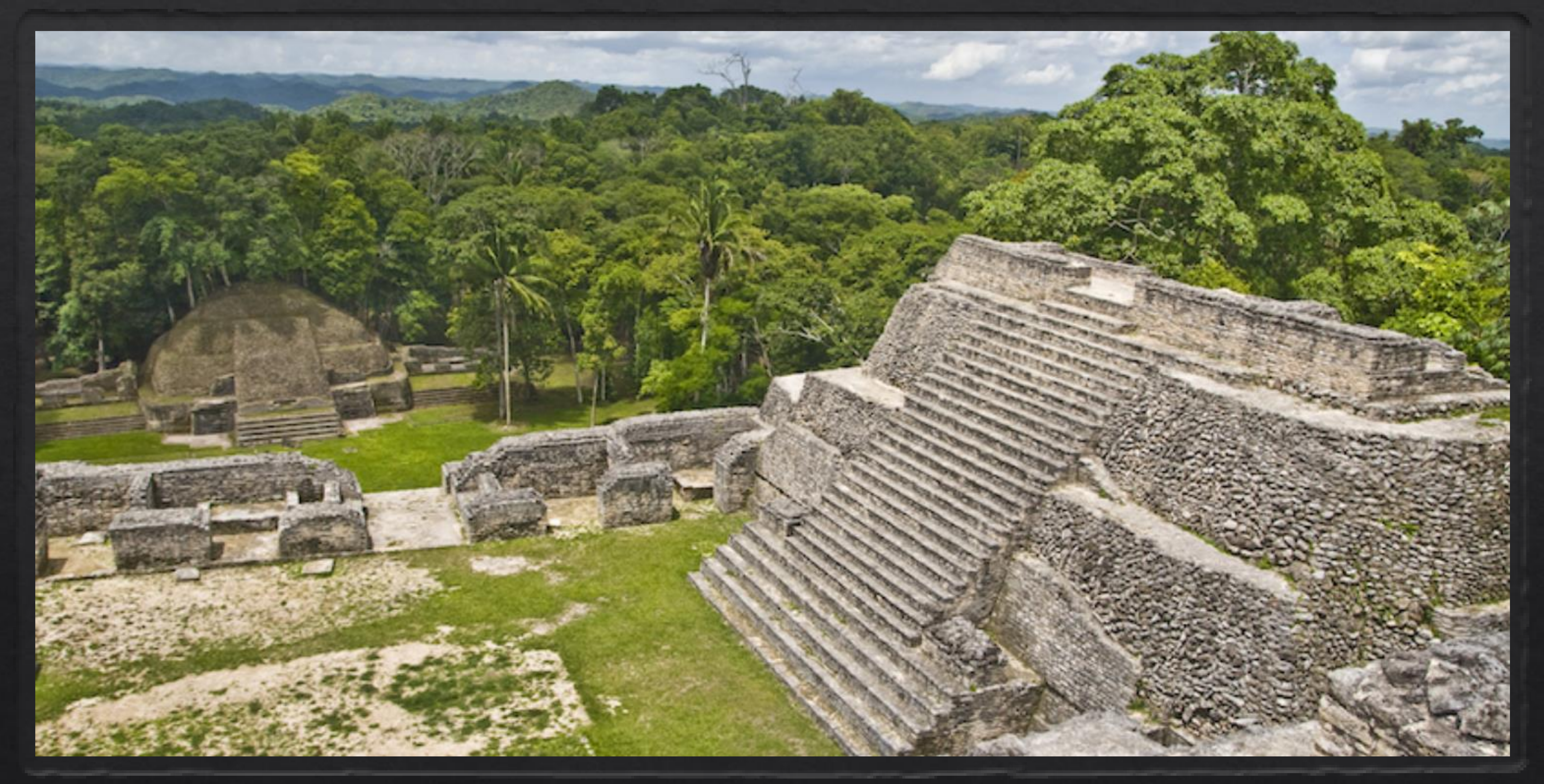
MAYAN ZIGGURAT IN BELIZE