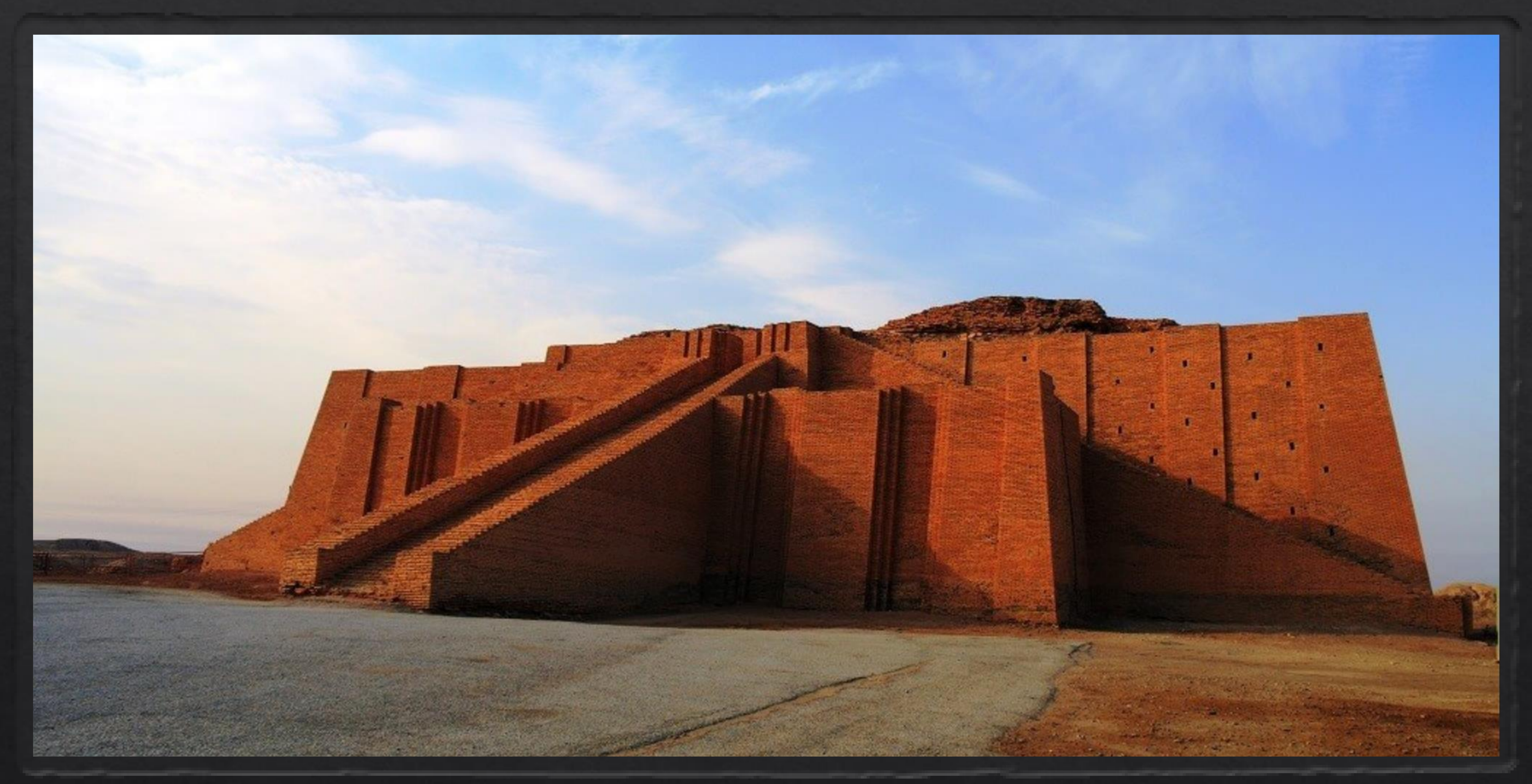
RECONSTRUCTED ZIGGURAT AT UR