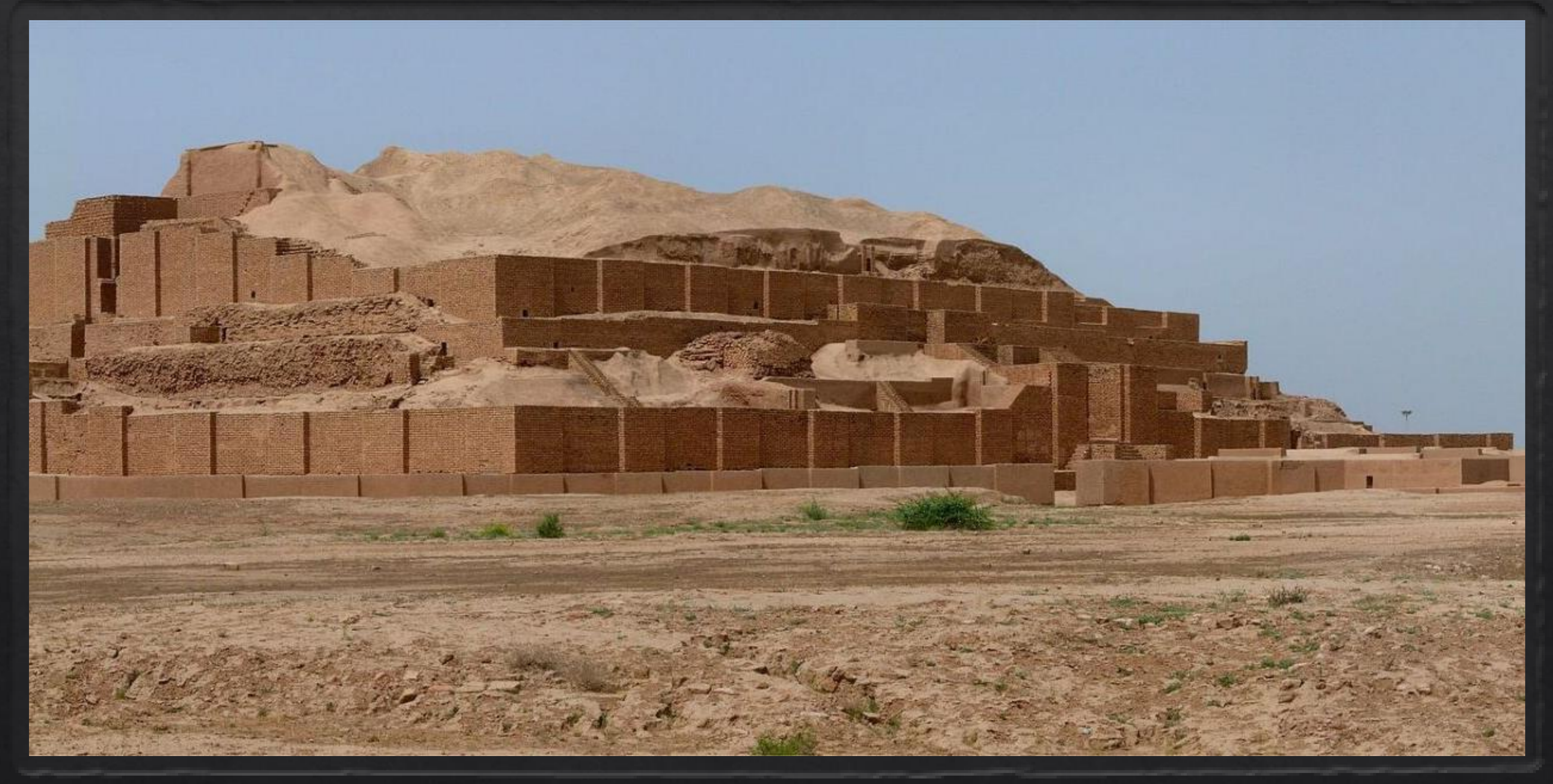
THE FOUNDATIONAL REMAINS OF THE CIRCA 1250 BC ELAMITE ZIGGURAT AT CHOGHA ZANBIL (A SITE NORTHEAST OF ERIDU)