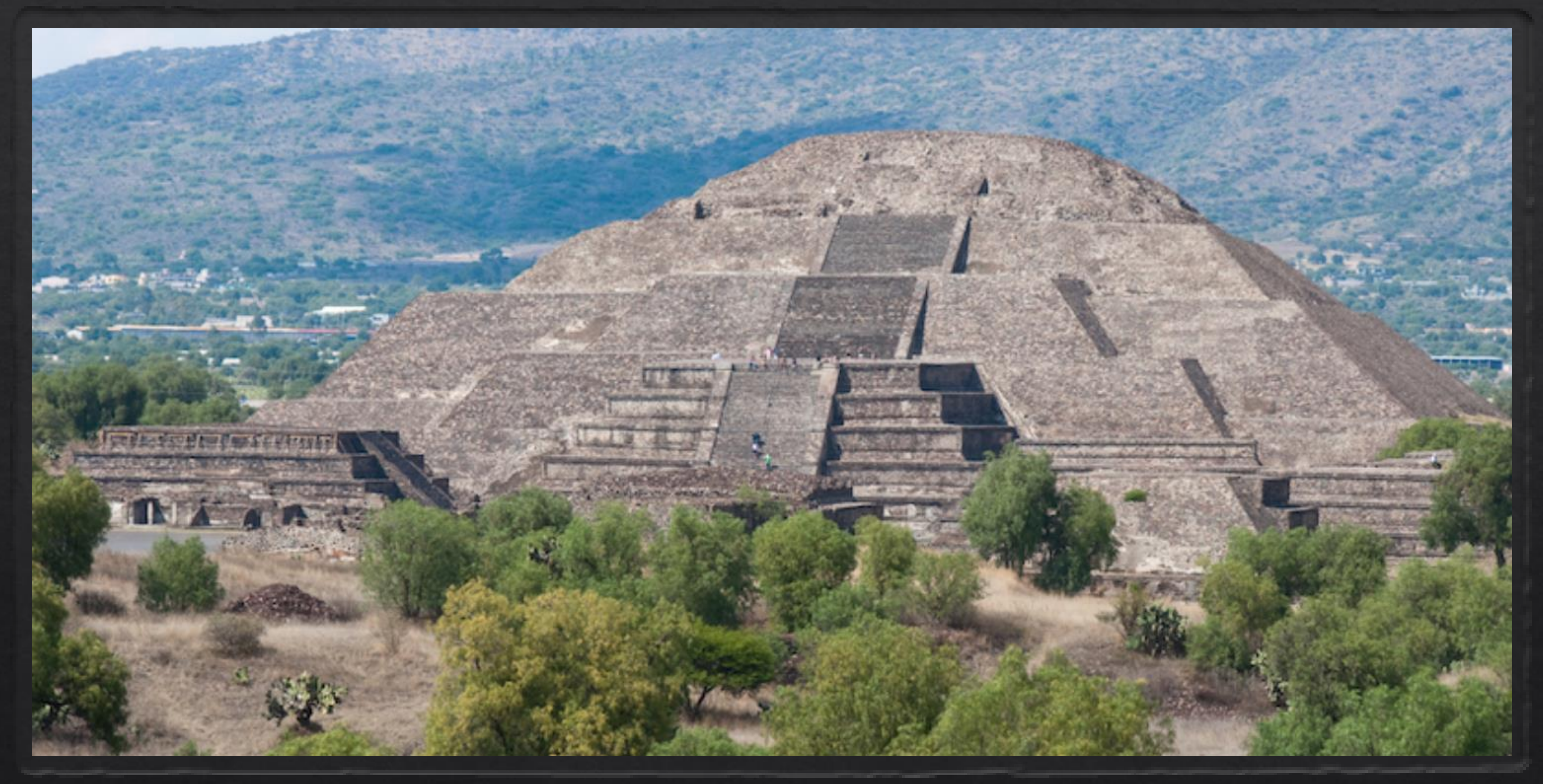
MESOAMERICAN ZIGGURAT IN MEXICO