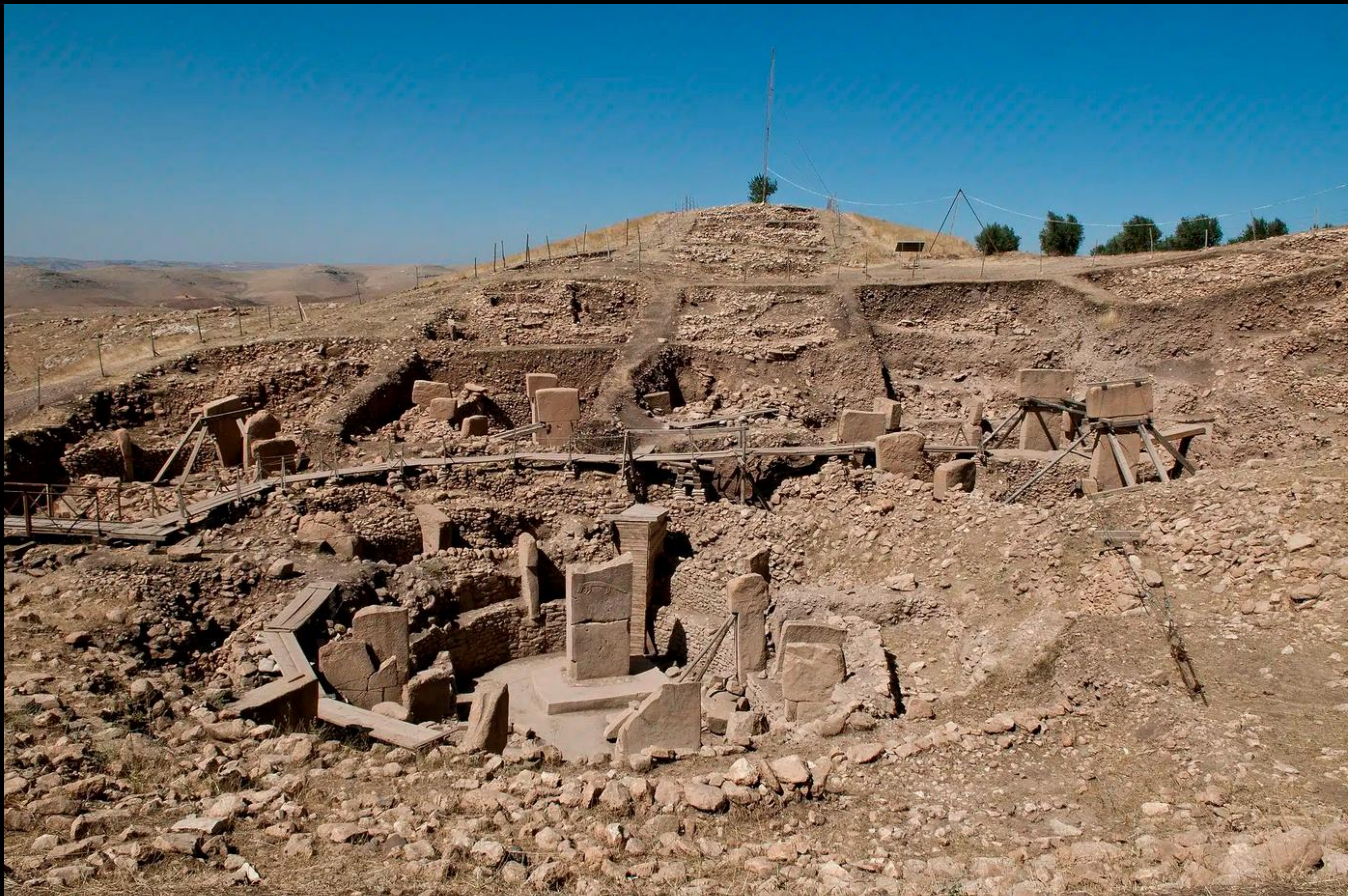
GÖBEKLI TEPE, AN ANCIENT TEMPLE SITE IN MODERN TURKEY.