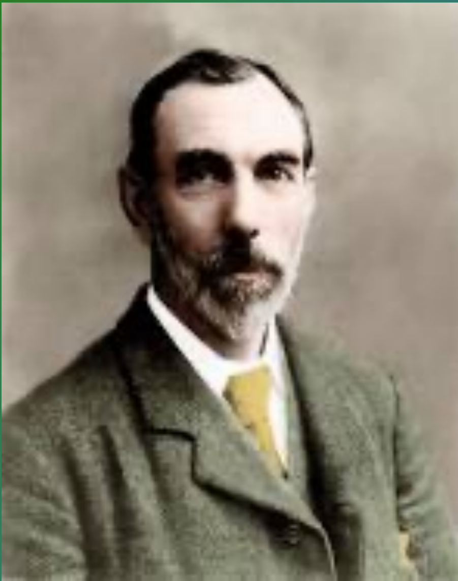
Sir William Ramsey