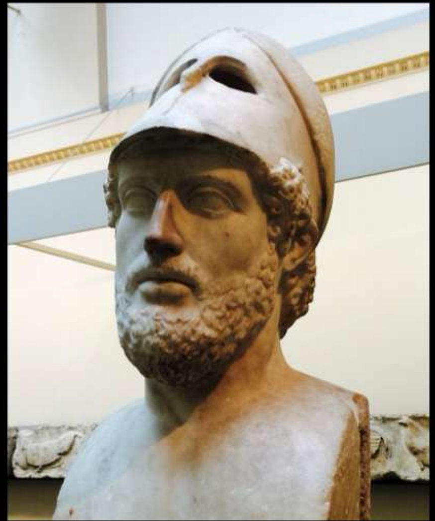
Pericles of Athens

“We do not say that a man who takes no interest in politics is a man who minds his own business; we say that he has no business here at all.”