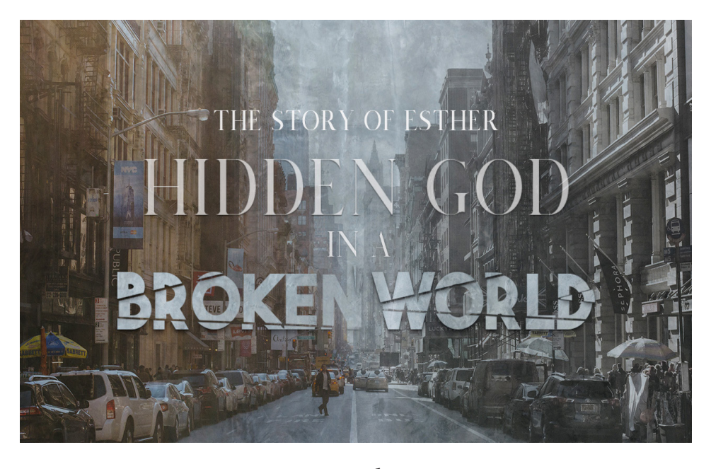
Fate - Esther 6

Making disciples of Jesus, gripped by the gospel, living for God's glory.