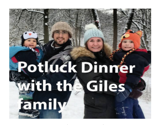
Saturday, March 10 5pm The Bible House