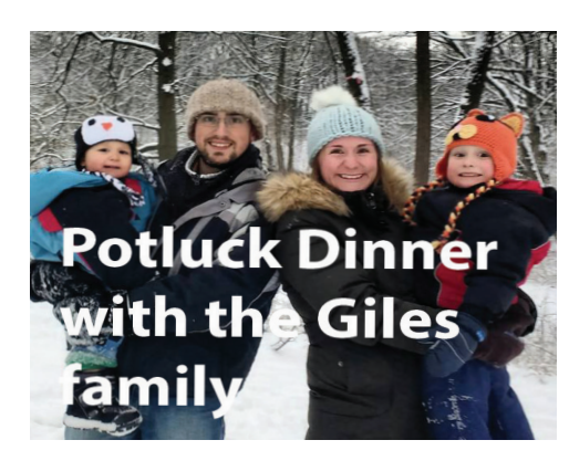
Saturday, March 10 5pm The Bible House