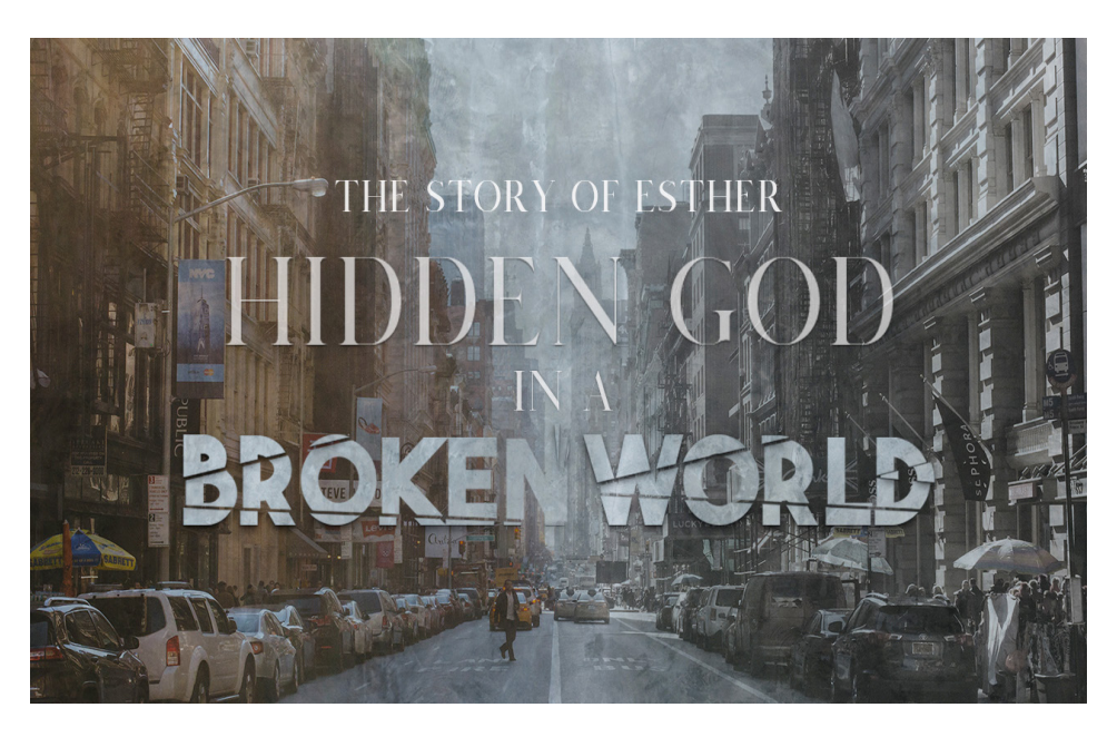
A Gospel Shaped Memory - Esther 9 - 10

Making disciples of Jesus, gripped by the gospel, living for God's glory.