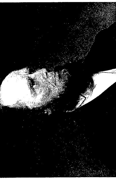
PHOTO: ILLUSTRATION BY GUY LAWRENCE FOR THEOLOGY AND THE FUTURE OF THE BIBLE